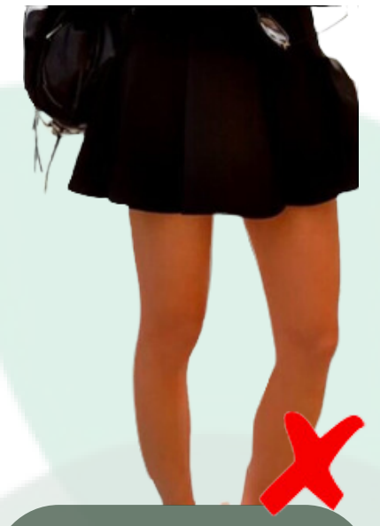
Skirts should be no more than 5 cm above the top of knee