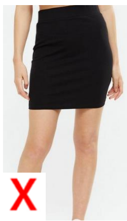
No lycra/tube skirts