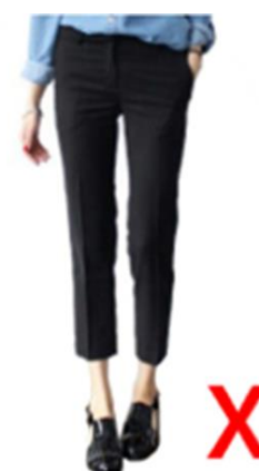
No skinny or cropped trousers