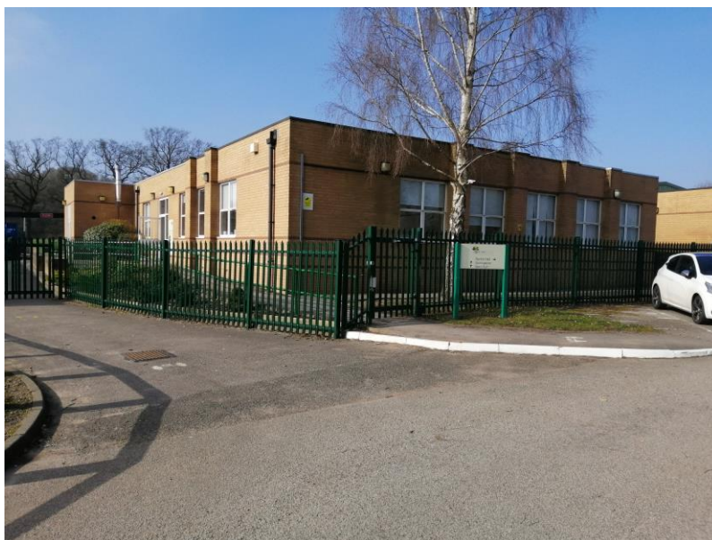
Zone 4 Entrance (Year 10)