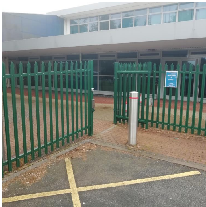
Entrance (Year 7)