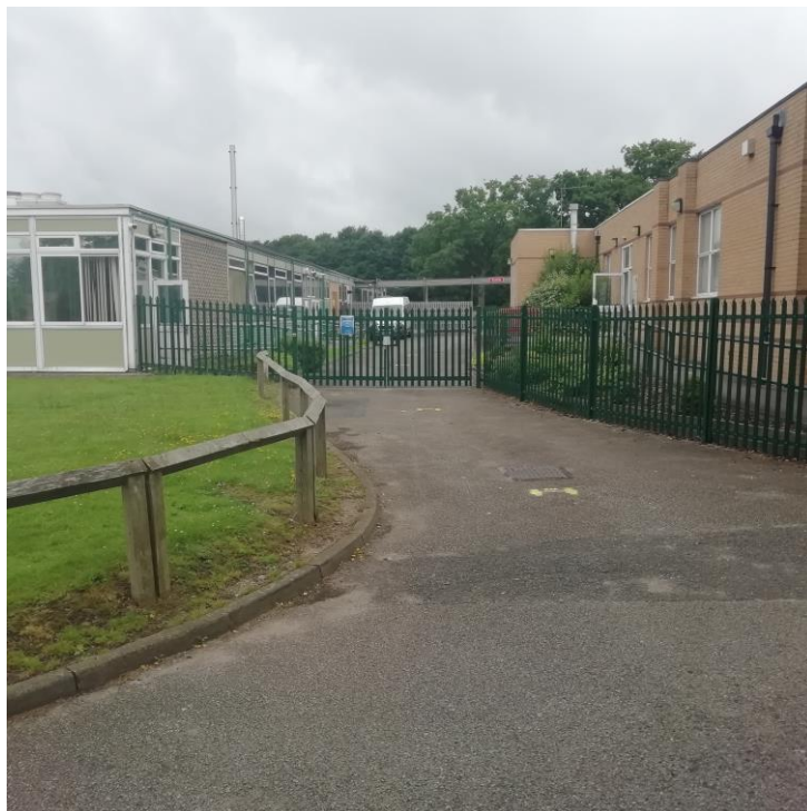
Entrance (Year 9)