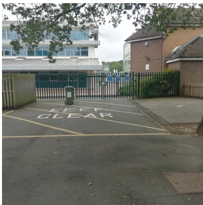
Entrance (Year 8)