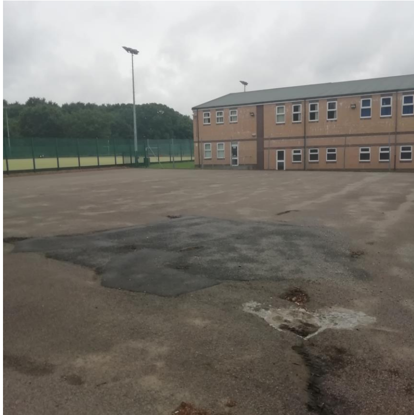
Entrance (Year 11)