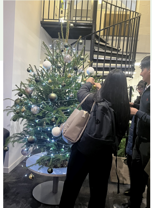
The Christmas Trees went up this week!