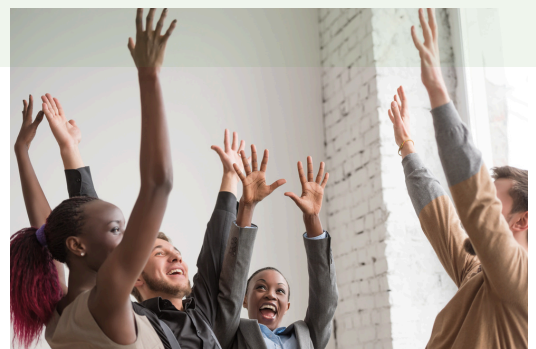
Last Day of Term 12:30pm Finish Casual Dress Celebration Assembly!