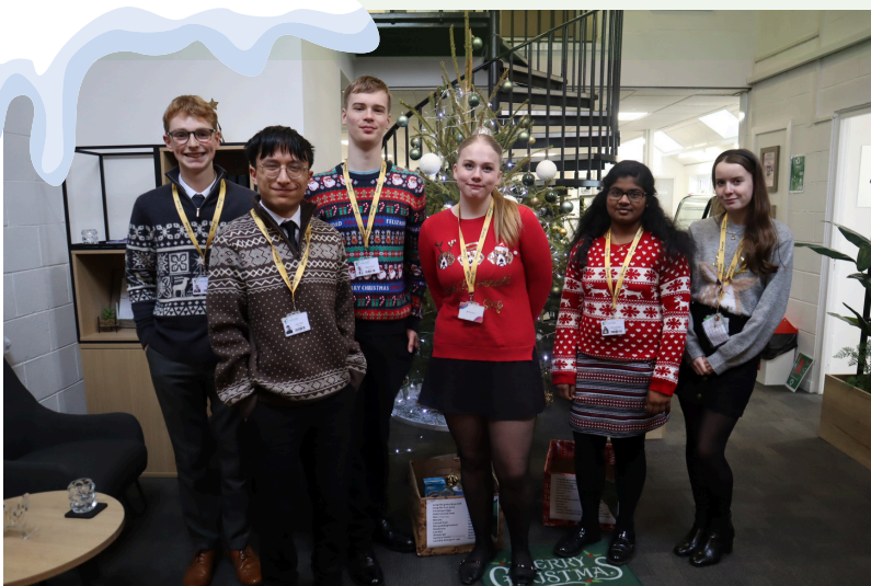
Christmas Jumper Day 2024

To mark this we will be celebrating students' efforts and successes in our end of term celebration assembly on Friday.