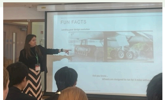
AEROSPACE APPRENTICESHIP OPPORTUNITIES